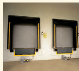
Rolling Service Doors