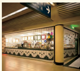
Rolling & Side Folding Security Grilles & Closures