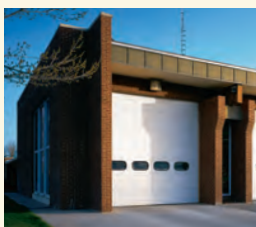
Thermacore® Sectional Doors